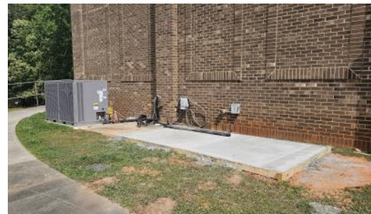
Expanded slab for new units coming .