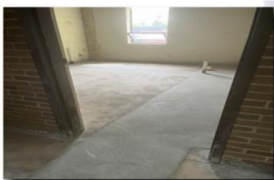
Top right and right: Trenching of sanctuary floor.