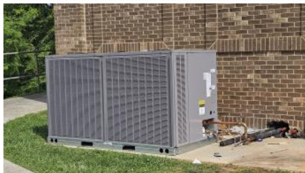
The first newly installed HVAC unit for the sanctuary.

Thank you to those who stepped up when invited to help.