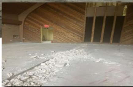
Left: Metal framing behind (?) the sanctuary