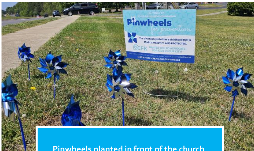
Pinwheels planted in front of the church.

April is child abuse awareness month, and Congregations for Kids is encouraging us to remember that not every child knows safety and security and