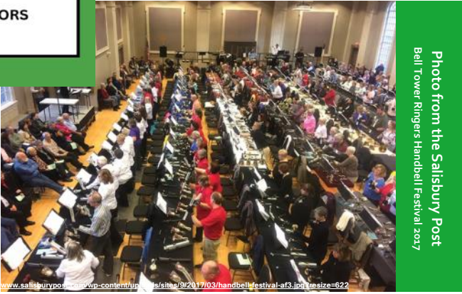
Bell Tower Ringers Handbell Festival 2017

There are 73 words that are at least 3-letters .