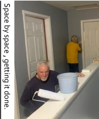
Space by space, getting it done.