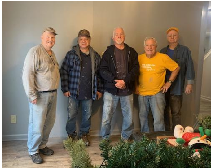
Serving together with purpose and with faith.