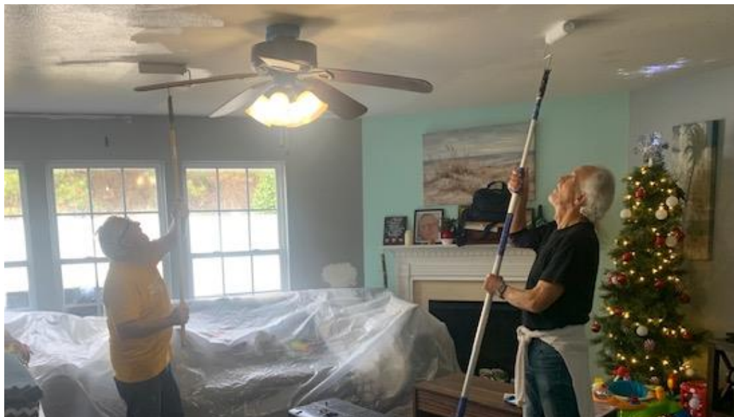
Attention to details