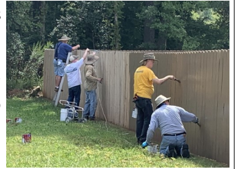
August 2021 Staining Party!

West Blvd ministry has 500 linear feet of fencing that needs to be stained. The Men's Fellowship group has stepped up and offered to assist with this project. The Men's Fellowship group could use your help.