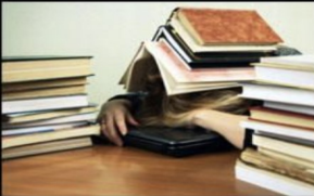
What I really do

The Children's Choir will present a joyful program May 12 for Mother's Day under the direction of Kelly Byrum. Please come out and support their choral performance.