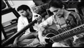
What my mom thinks I do