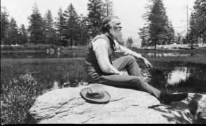
What musicians think I do