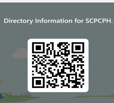
Directory Information Form QR Code

2.) To assist us in compiling your information for the printing company, we have created a Microsoft Form for each household to complete. A paper version will be available at the church. Click here to complete your Directory Information form or scan the QR code below.