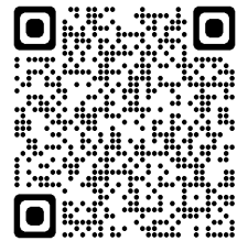
Ben Brown Scholarship Application QR Code

Tap or scan QR Code to be directed to the application. Link also above in blue.